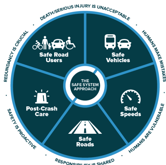
Figure 3. The Safe System Approach

The U.S. Department of Transportation recently announced the new comprehensive National Roadway Safety Strategy (NRSS) 11 , a roadmap for addressing the national crisis in roadway fatalities and serious injuries. Bolstered by historic funding included in President Biden’s Bipartisan Infrastructure Law, the NRSS is the first step in working toward an ambitious long-term goal of reaching zero roadway fatalities. The NRSS provides concrete steps that the Department will take to address this crisis systemically and prevent roadway deaths and serious injuries.